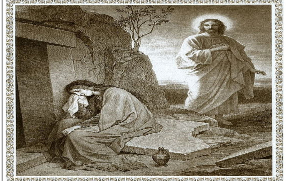
(Painting by Heinrich Hoffman, 1800s)